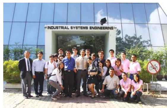
Figure 8 Happy ending