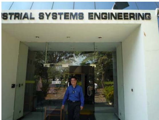
Figure 1 A reception