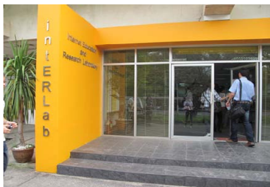
Figure 3 Internet education and research lab

In the visit route of internet education and research lab (see figure 3), there was one thing that impressed me very much. The manager gave us an excellent presentation regarding the introduction of lab research interests (see figure 4). Please notice that, he is a Ph.D. student and did not know that we would go there before. I think the lab manger of our department (YZU) should have the same skills and also a good ability to deal with contingency or emergency.