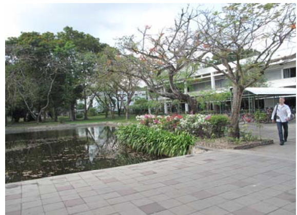
Figure 2 The environment of AIT

In the visit route of internet education and research lab (see figure 3), there was one thing that impressed me very much. The manager gave us an excellent presentation regarding the introduction of lab research interests (see figure 4). Please notice that, he is a Ph.D. student and did not know that we would go there before. I think the lab manger of our department (YZU) should have the same skills and also a good ability to deal with contingency or emergency.